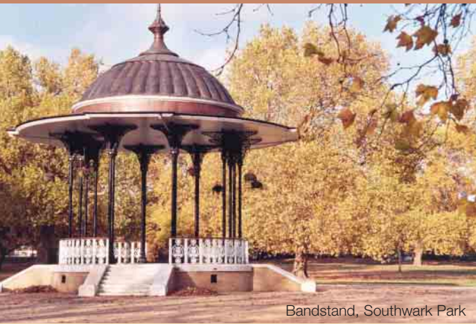
Bandstand, Southwark Park

“Opening up the disused rail bridge for pedestrians and cyclists will make it easier for them to access the area's wonderful waterways, parks and docklands. The disused bridge is sandwiched between some of the most exciting regeneration projects in the country and is set to become a living landmark, integral in bringing our community closer together.”