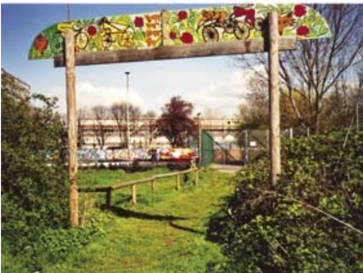
An entrance gate at the Burgess Park Bike Track